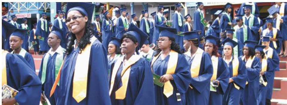
4th amalgamated graduation ceremony of the SVGCC