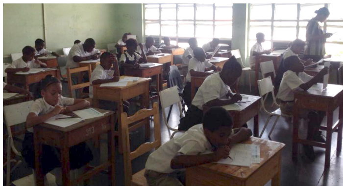
CPEA final exam. Photo taken at the exam centre in Georgetown

A total of 1948 students registered for the Caribbean Primary Exit Assessment (CPEA), 1934 of whom wrote the final examination.