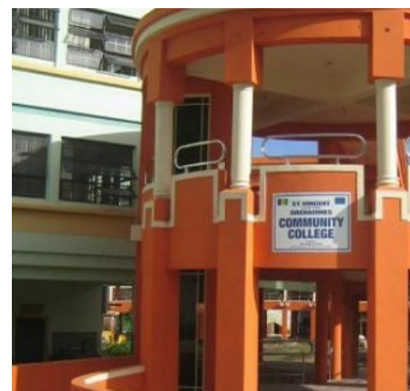
A refurbished building at the Glen campus

This year's results show that high pass rates have been maintained in most subjects taken. Other Advanced Proficiency Subjects were taken at the Cambridge International Examinations. These are reported on separately.