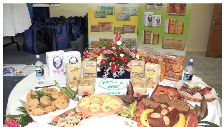
Food and Beverage service - one of the courses offered for the CVQ