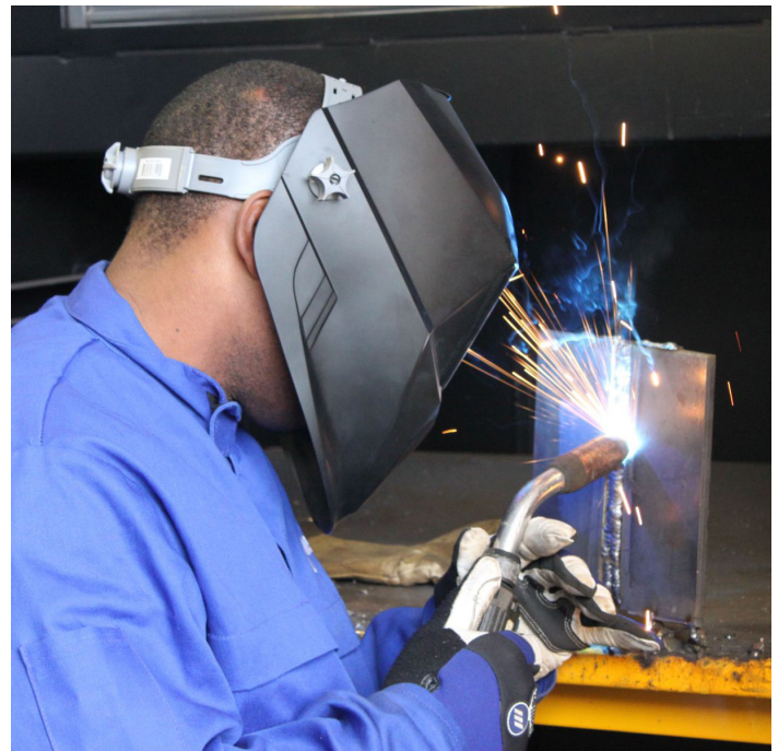
Welding - one of the courses offered for the CVQ

The Caribbean Vocational Qualification (CVQ) has not yet been offered in St. Vincent and the Grenadines but work towards this is being done through the Adult and Continuing Education Unit of the Ministry of Education. For more information on the CVQ, please visit http://www.cxc.org/examinations/exams/cvq