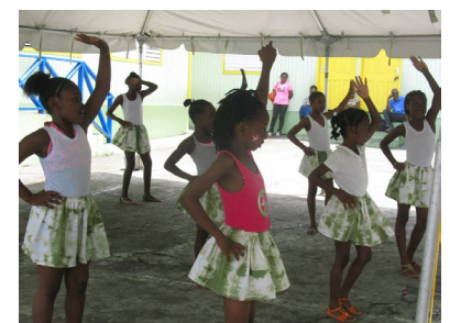
Above: Dance display by female students