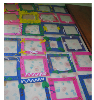
Art and Craft display area. Students created a variety of items