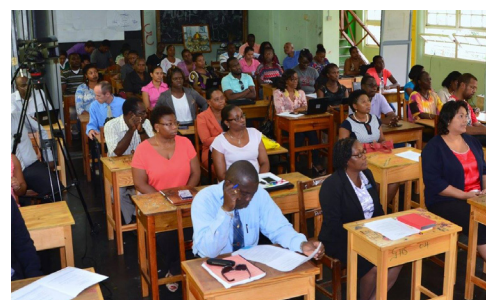
Opening session of the ICT Integration Workshops at the Girls' High School

The workshops are being held at various venues throughout the country, over a four-week period. They commenced on Monday July 28 and will end on Friday August 22. Each group of teachers will attend one week (twenty-five hours) of training.