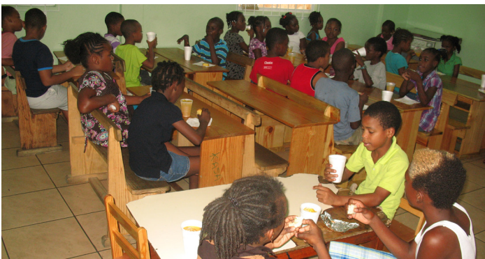
Students enjoying light refreshments at the programme