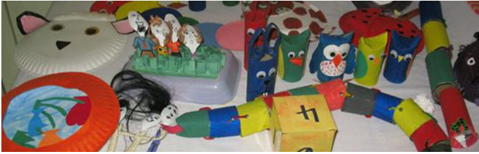
Early Childhood teachers were exposed to recyclable and house hold materials to create craft items - Facilitator RoseMarie Lewis