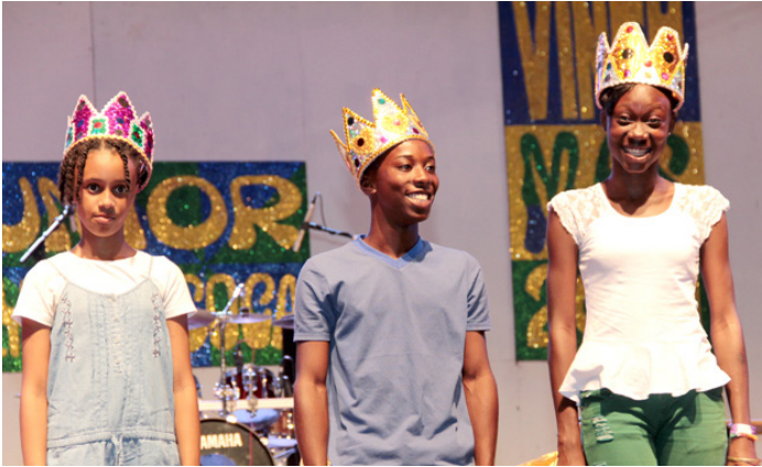
Winners of the 2014 Junior Soca and Calypso Monarch