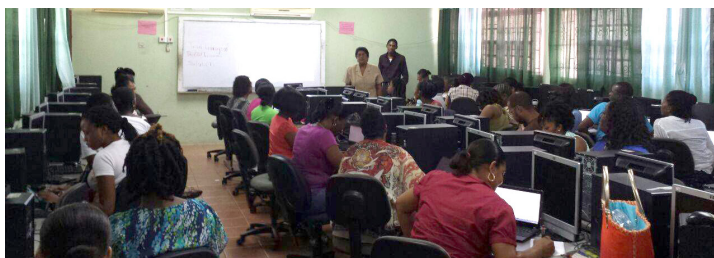
ICT Integration Workshop for secondary school teachers

To this end, the Ministry of Education in collaboration with the National Centre of Technological Innovation (NCTI), is conducting a series of workshops. The target group consists of seven hundred secondary school teachers and the training sessions are taking place under the theme “Fostering a brighter horizon through the use of technology”. The programme is being sponsored by Digicel, SVG Ltd.