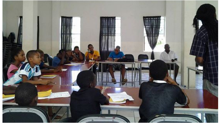
Students from Clair Valley and Questelles Government Schools

The National Commission on Crime Prevention (NCCP) organized the annual Pan Against Crime Summer Program, in collaboration with a number of stakeholder entities, including the Ministry of Education. The programme began in July and is scheduled to finish closer to the end of August.