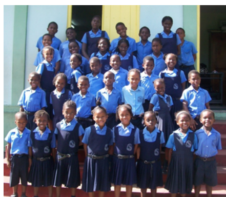
Students of the New Prospect Primary School February 2013