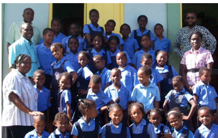
Staff & Students of the New Prospect Primary School February 2013