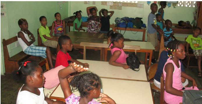
Students participating in class activities at the Kingstown Anglican School Annex

Behaviour change through positive means was the idea behind a recently concluded Behaviour Modification programme.